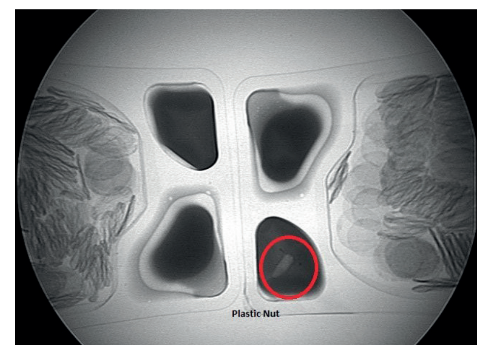
X-ray and metal detection systems can identify foreign contaminants in consumer products.

Contamination of a product with unsafe chemicals or other 'leachables' is not the