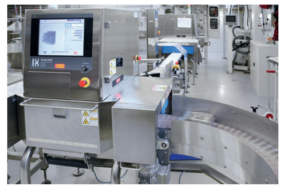
X-ray detection equipment is commonly used in food, beverage, and pharmaceutical applications.