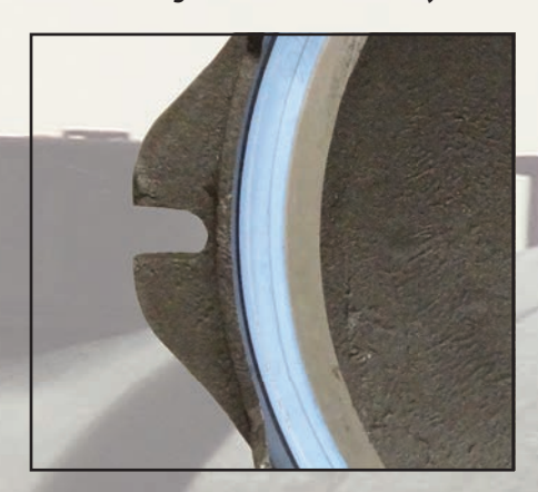
Teadit Origin™ RC510 after 40 Cycles